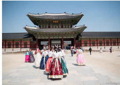
Wear a hanbok and feel like a princess