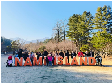
OOTD in Winter Sonata spot