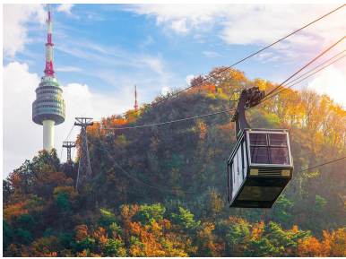
Ride a cable car to Namsan Tower