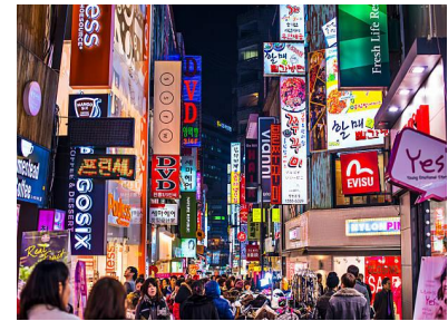
Shop like crazy.