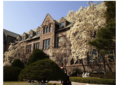
Living in Kdrama world