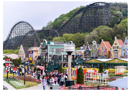
Scream your lung out while riding roller coaster