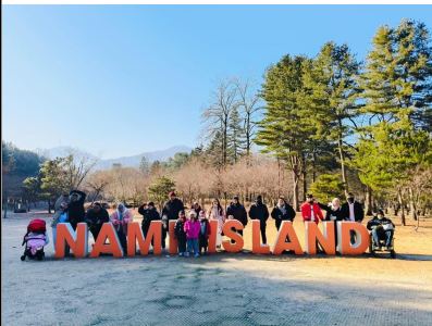
OOTD in Winter Sonata spot