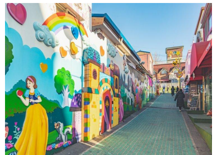
Celebrate your inner child in fairy tale village