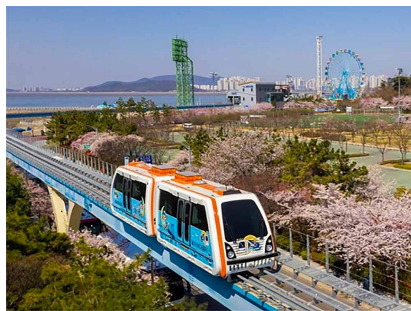
Exploring beautiful Wolmi by sea train