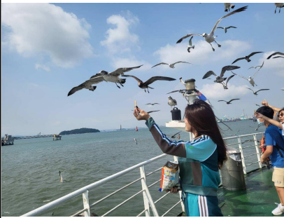
Feed the seagulls while cruising